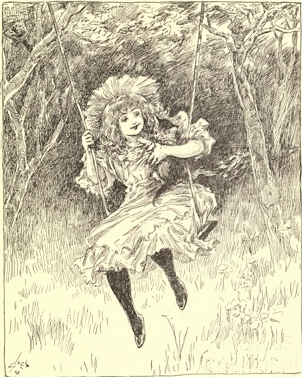
"I DID NOT LIKE THE SWING AT FIRST"